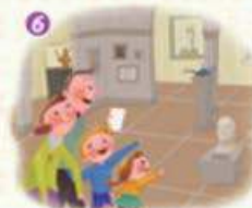
visit an art museum