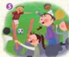
go to a soccer game