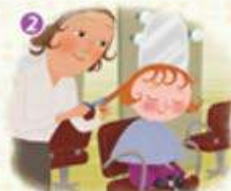
get a haircut