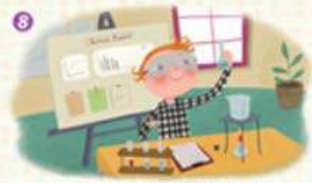
work on a science project