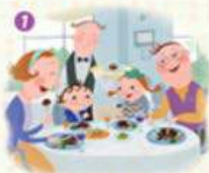
eat out at a restaurant