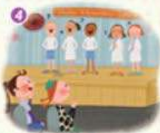
go to a school concert