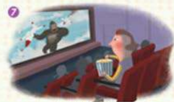
watch a movie