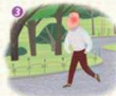
go for a walk